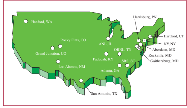
Figure 1. Applications of RESRAD family of computer codes to sites contaminated with radioactive residues

RESRAD uses a pathway analysis method in which the relationship between radionuclide concentrations in soil and the dose to